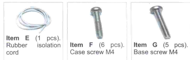
Item E (1 pcs). Rubber isolation cord