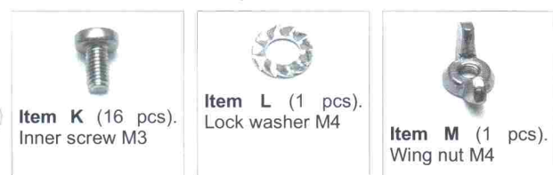
Item K (16 pcs). Inner screw M3