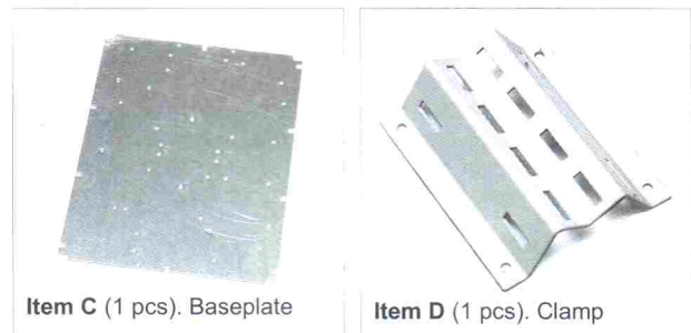
Item C (1 pcs). Baseplate