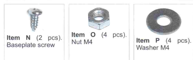
Item N (2 pcs). Baseplate screw