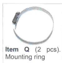
Item Q (2 pcs). Mounting ring