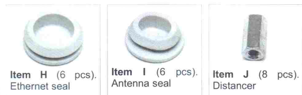
Item H (6 pcs). Ethernet seal